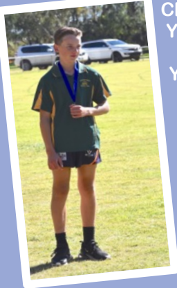
Champion Yr. 6 Boy and Yr.6 Girl