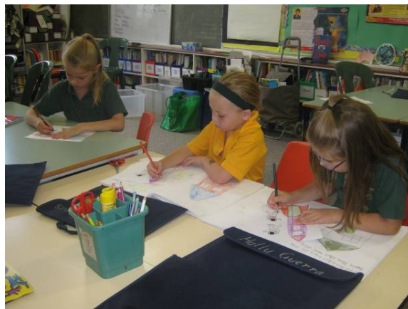
Pictured above: Girls at work during library.

We had a very productive meeting on Monday night. We have finalised plans to spend our School Pride money. Fencing is a priority and you will begin to see new fencing around the school in the very near future.